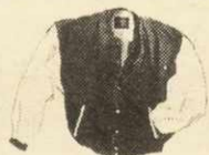
All Season Denim Club Jacket MSRP $150.00