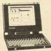
GRAND PRIZE EPSON ActionNote 500C MSRP $2406.00