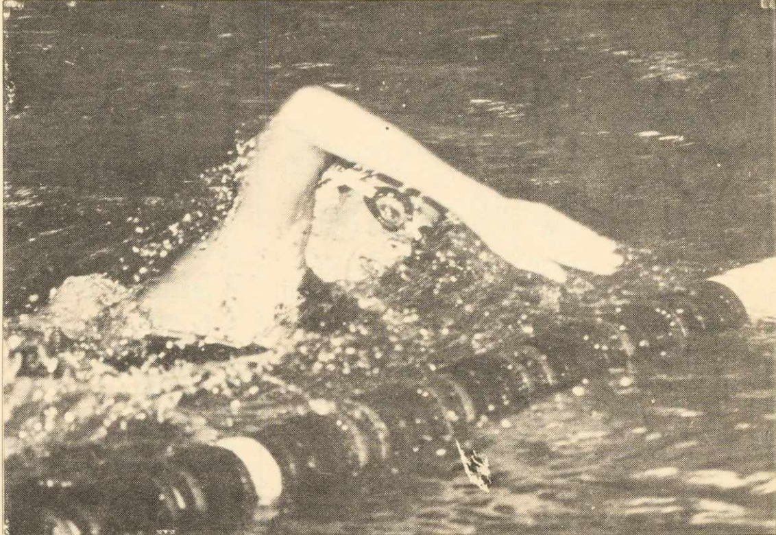
The CIAU swimming championships, which were held last weekend at the Dalplex, created quite a splash as many new records were set.

After the first day in the pool, Toronto led in the women's team standings with 187 points. They were followed by the defending champions from UBC and the Calgary women's team. The Dalhousie Women were 12th out of 18 teams. Defending champions Toronto had, 119 points for first place in the men's division. They were followed by Calgary and Victoria. Dalhousie stood just out