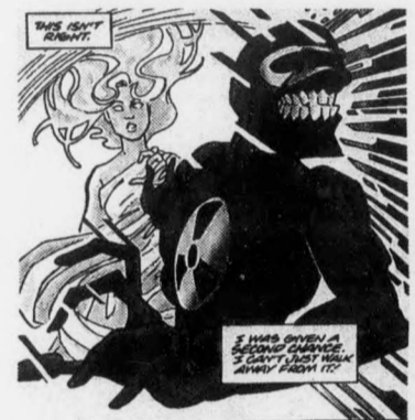
Yoww, that's gotta hurt the ol' pumpkin

The other day the great folks at ACCLAIM Comics sent me a little package of goodies. ACCLAIM has been handling the Valiant Comics line for a year now. They have brought fresh ideas to the Valiant heroes giving readers a renewed interest in Valiant/ACCLAIM Comics. ACCLAIM has also diversified its offerings by giving readers a chance to read their Fantasy imprint Armada which for you Mana tappers deals with Wizards of the Coast's Magic. Windjammer is another imprint that is sort of like the "creator's owned universe." They're all really good. So check 'em out.