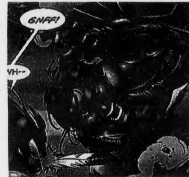
Turok says "Fantastic Four sucks rotten toenails."