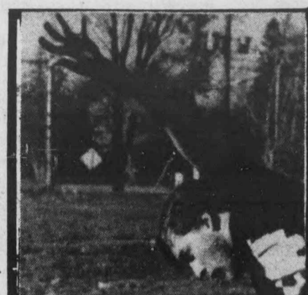
James Taylor "Isn't that in the Aids Pamphlet"