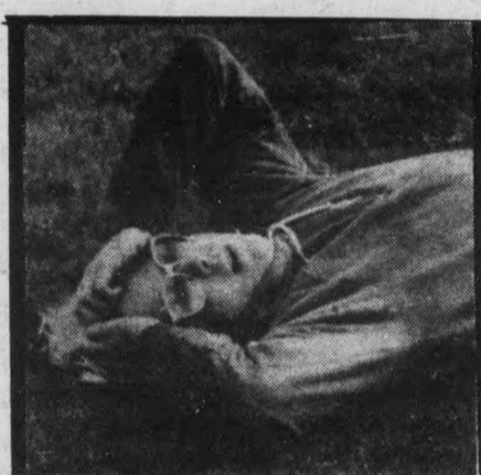
? "Great sex tonight"