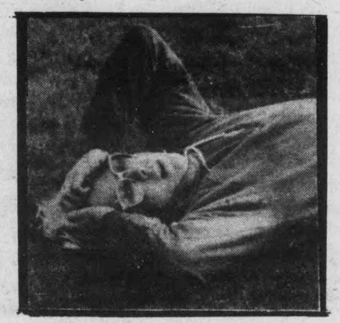
"Great sex tonight"