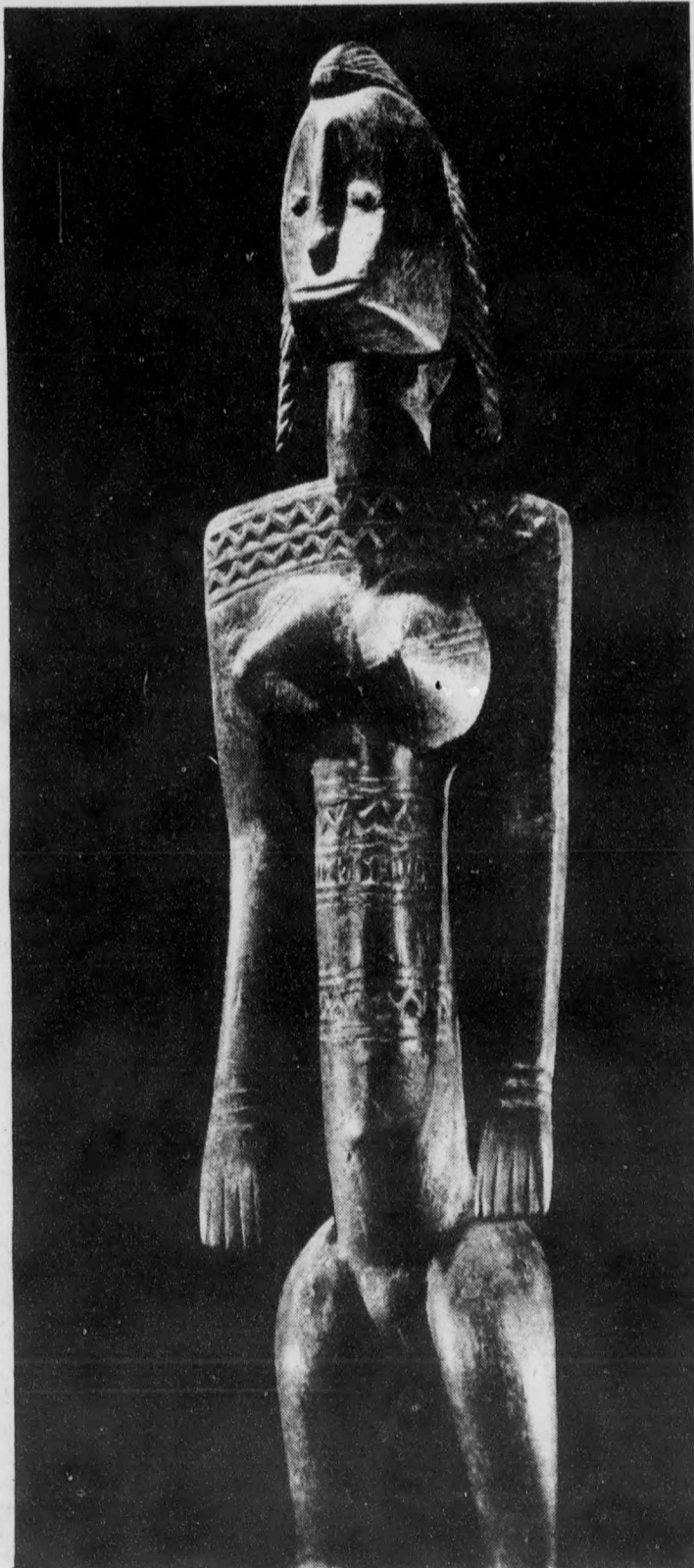
Above is a female ancestor figure, carved in wood, from Africa's Ivory Coast. It is an example of Ritual Sculpture from Black Africa, an exhibit at Mem Hall from the Montreal Museum of Fine Arts.

Anyone interested in attending is welcome. Coffee will be served from 12 noon to 1 p.m. in the Tartan room, Memorial Student Centre, and everyone is invited to bring a lunch.