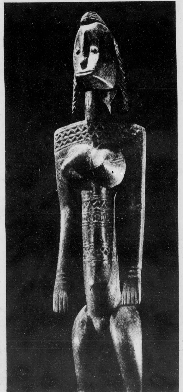
Above is a female ancestor figure, carved in wood, from Africa's Ivory Coast. It is an example of Ritual Sculpture from Black Africa, an exhibit at Mem Hall from the Montreal Museum of Fine Arts.

All inquiries should be addressed to the National Theatre School, 5030 St. Denis St., Montreal (Que.) H2J 2L8 (tel: 514-842-7954) as soon as possible. The School will send application forms to everyone so requesting. Candidates will be informed of the date and place of their audition and-or interview shortly after their completed application forms have been received by the School.