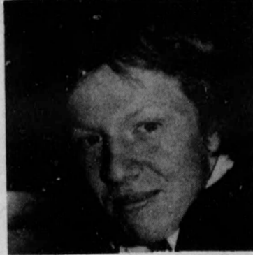
Charlie Fleet Sc 1 I think the ticket sales should have been broken up into 2 places - possibly the STUD - due to the fact that most Science students have labs.