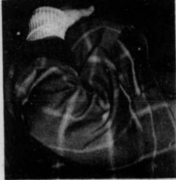
Pam Ritchie Arts 2 It was the shits.