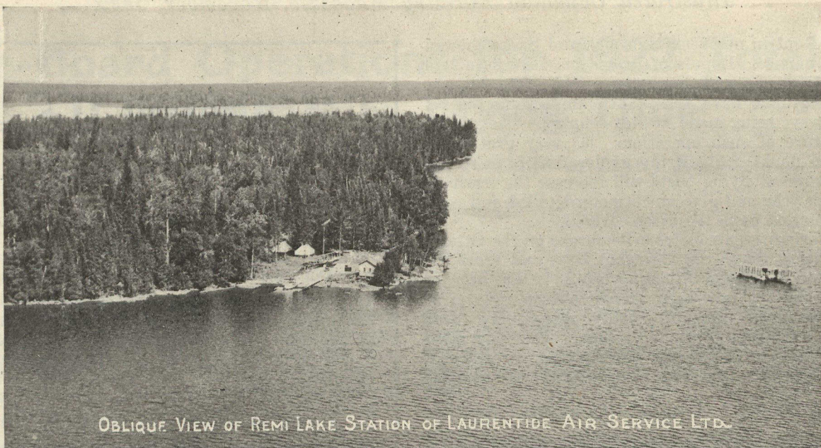
OBLIQUE VIEW OF REMI LAKE STATION OF LAURENTIDE AIR SERVICE LTD.