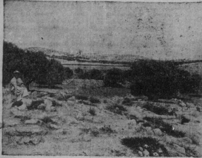
FIELDS OF THE SHEPHERDS, BETHLEHEM.

Please accept as a Christmas present my share in the Pochunk bank raid, which I think will about cover your loss. I used to read Sunday school books once, and in them I remember the thief was