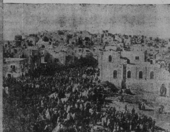
PILGRIMS ENTERING BETHLEHEM ON CHRISTMAS DAY.

be found among its inhabitants today, and the dwellers can in no way claim to be descended from that race, though some travelers think they see a resemblance in their appearance to the Jewish type. The town which saw the birth of Christ is inhabited almost entirely by Christians. They are a thrifty and industrious people and superior in every way to the other village dwellers round about Jerusalem.