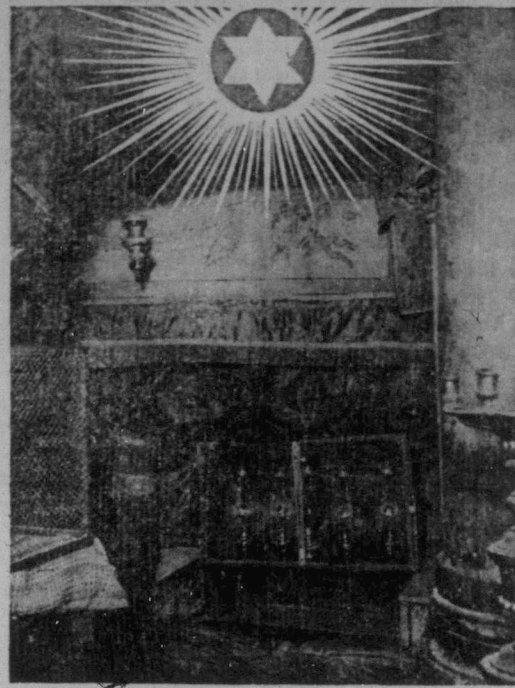
MANGER, CHURCH OF THE NATIVITY, BETHLEHEM.

the Church of the Nativity in Bethlehem, and, sad to say, because of the frequent quarrels between the different sects which meet within this church at a time of general rejoicing, Turkish soldiers, with drawn swords, are on