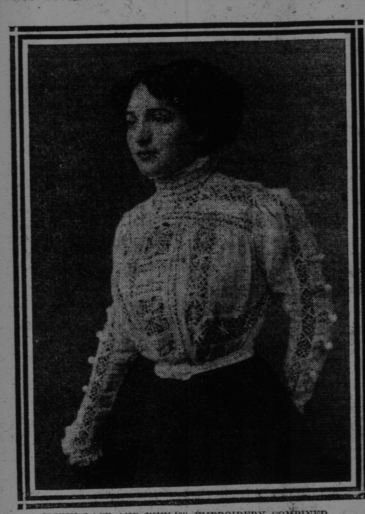
CLUNY LACE AND EYELET EMBROIDERY COMBINED. The fine embroidery allows make very pretty blouses, and the model illustrated shows a very smart method of trimming...