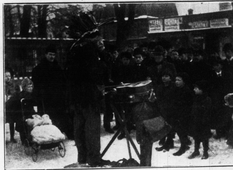
HOW THE STREET PEDLER HOLDS THE CROWD.

Mezzo-soprano soloist from Metropolitan Opera House, New York, who will be the leading vocal artist at the National Chorus Concerts at Massey Hall next Tuesday and Wednesday.