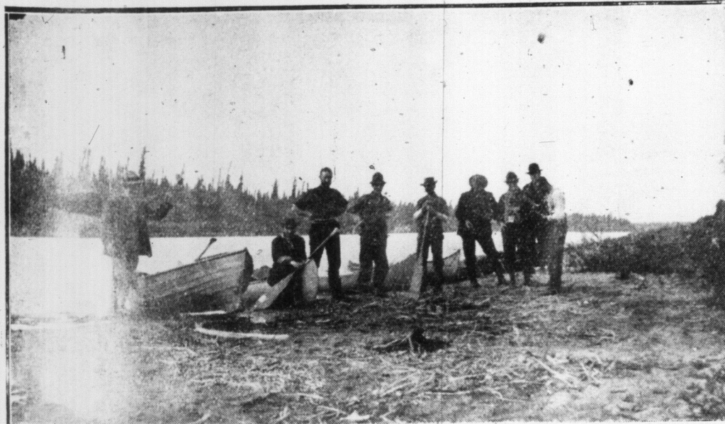
Windbound at the head of Frederickhouse Lake.