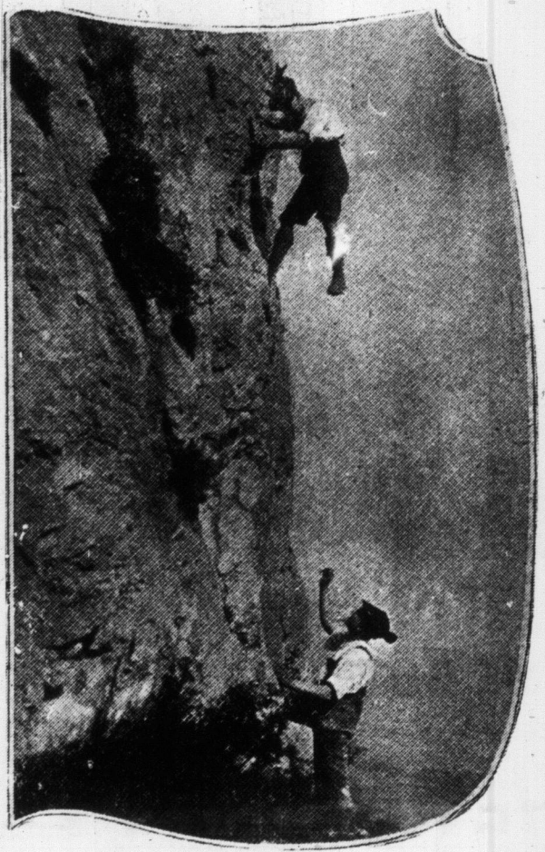
RISKY WORK OF THE MOUNTAIN CLIMBER.

1.—Ladies first. 2.—A life-and-death jump. 3.—An awkward position. 4.—Finding a foothold.