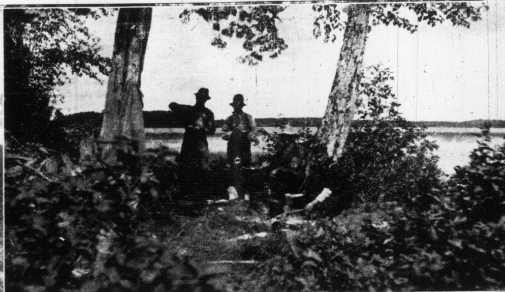
Prospectors camp on site of old Hudson Bay trading post.