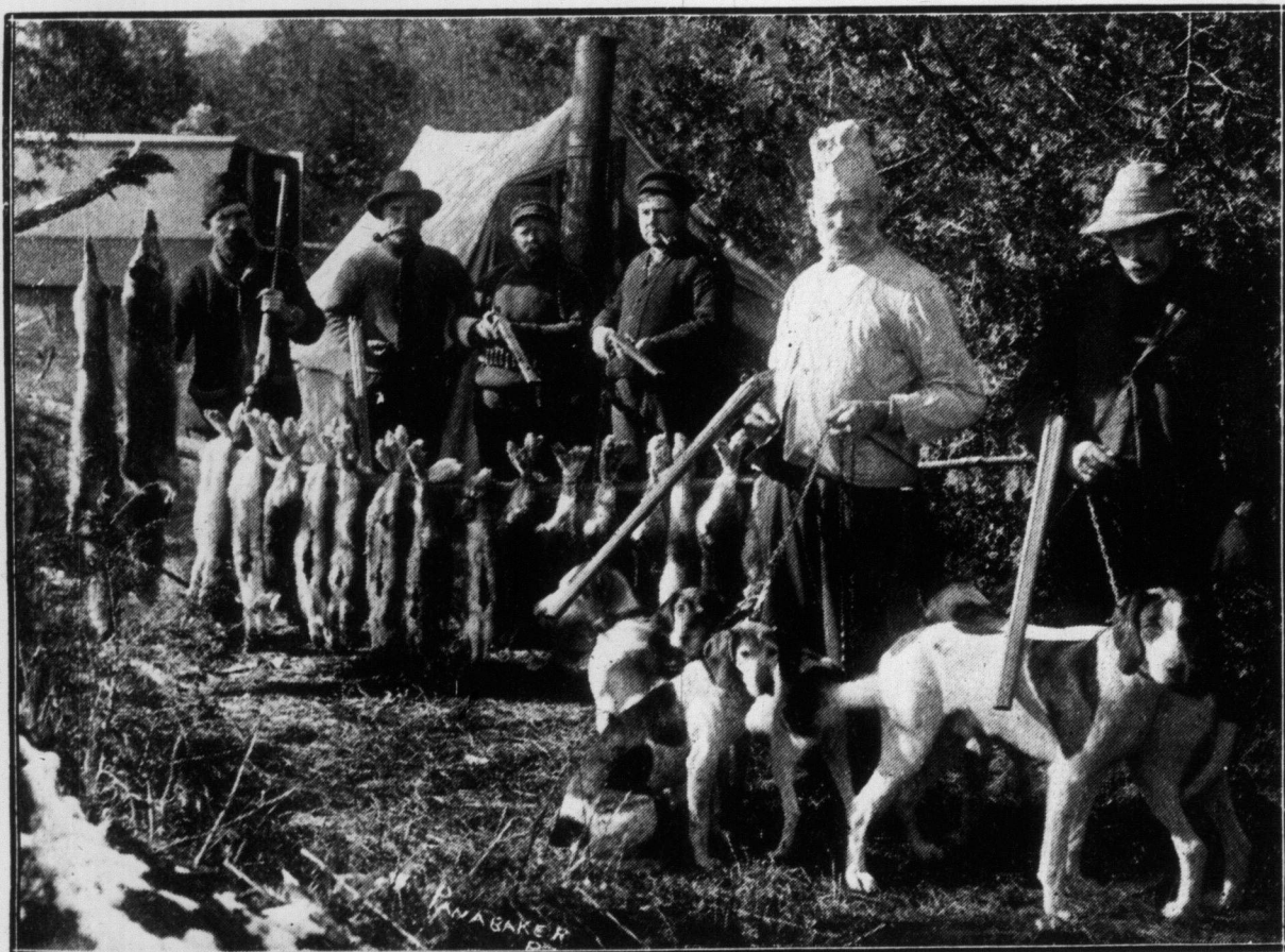
WHAT THE BUSH ABOUT HARRISTON YIELDS. Result of a day's shoot by Harriston sportsmen.