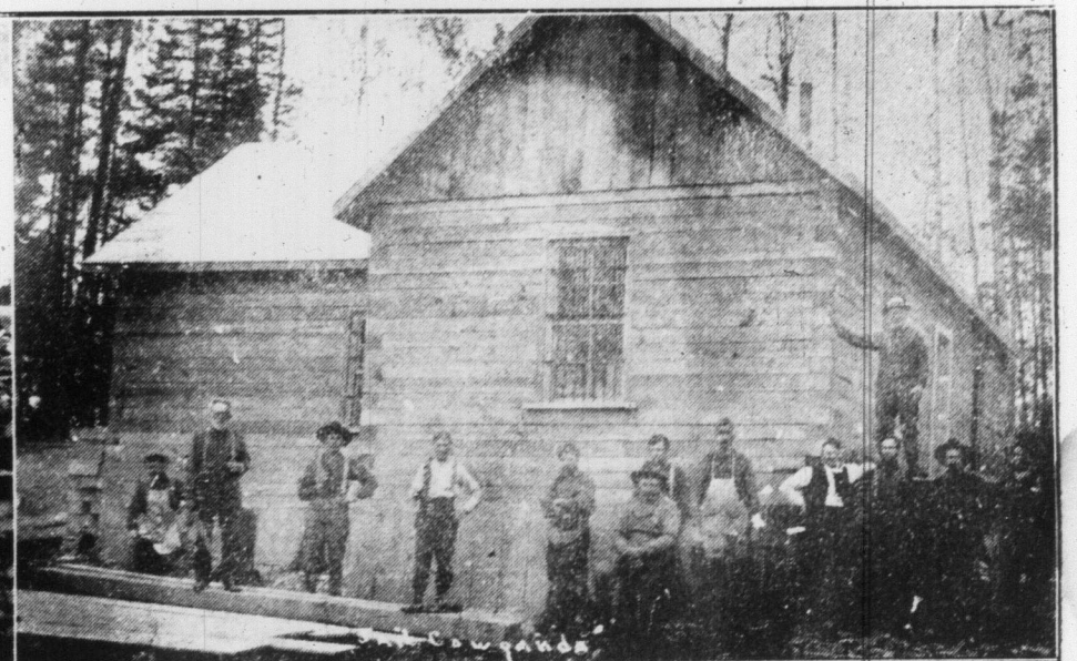
Where the unruly are disciplined. Jail in Gowganda.