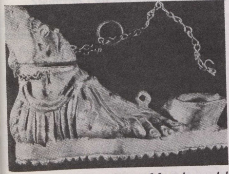
Bronze oil lamp in form of foot in sandal. Cover is decorated with man's head wearing head-dress (circa 4th-5th century A.D.)

While a few pagan fragments from the Roman Empire and some works from the European Renaissance and later are part