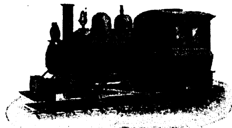
LOCOMOTIVES and DUMP CARS ATLAS CAR MOVERS LIGHT RAILS

Full descriptive catalogues mailed on application.