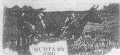
GURTA 4th (1181)

Mine is one of the largest and most successful show herds in Canada. They are finely bred and of great individual merit. Bulls, heifers and cows always on hand for sale; also a few good Leicester sheep. Correspondence solicited. Visitors welcome. Address