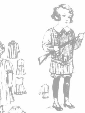
6858 Boy's Box 2. 4 and 6 years

clease order by number, giving age or asurement as required, and allowing at est ten days to receive pattern. Price. cents per pattern. Address, l'ashion