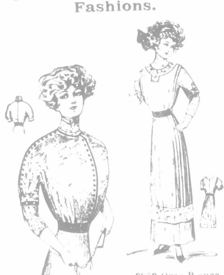
6857 Blouse with Chemisette and 34 to 42 bust.