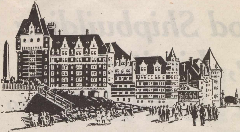
CHATEAU FRONTENAC, QUEBEC.