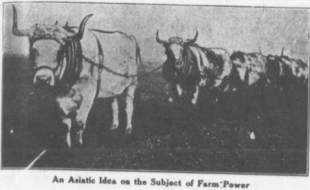
An Asiatic Idea on the Subject of Farm Power

"The farmer is usually required to run his own car which takes his time away from home and his time is or should be far more valuable than the hired man's. While with the horse the boy or the 'poorwit man on the job' can draw the milk. But under favorable conditions autos are convenient and a time saver. For about six months in the year while every horse is pressed into service and time is very valuable, they are certainly very satisfactory. But when the