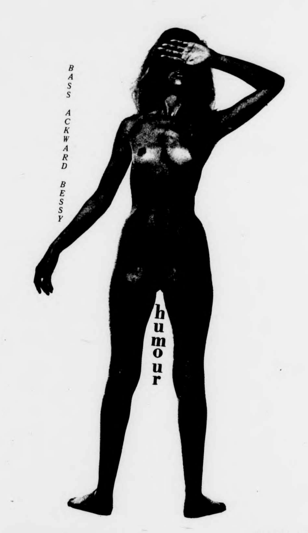
reprinted from Ubyssey

i know, i know, but these meetings in the dark, behind our friend's backs are evil we must realize that this is the end