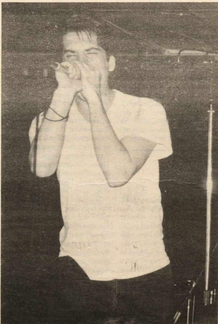
Bubaiskull: stirring up a slam-fest at the Double Deuce

Bubaiskull ended far too early (2 am) but I walked home happy to have seen a brilliant live show, and freezing because it was still -26 degrees outside! At least I was safe in the knowledge that the Halifax scene was stronger than ever and only shows signs of improving. Now, to get that Cod Can't Hear CD!