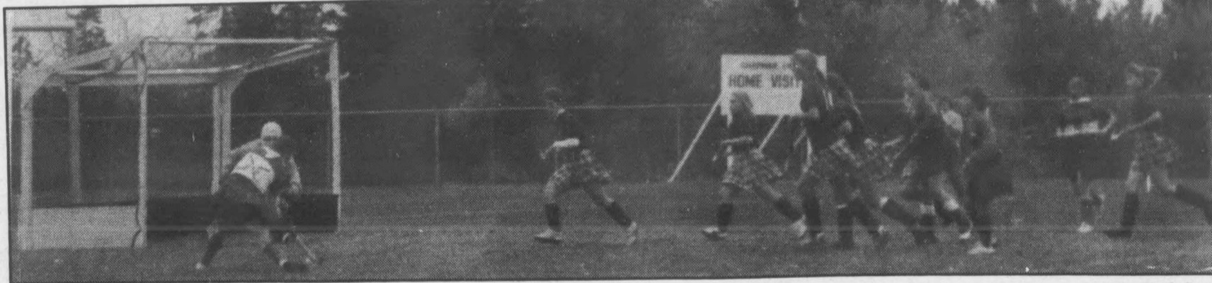
UNB scoring one of their 3 goals on Sundays shut-out against St. FX.