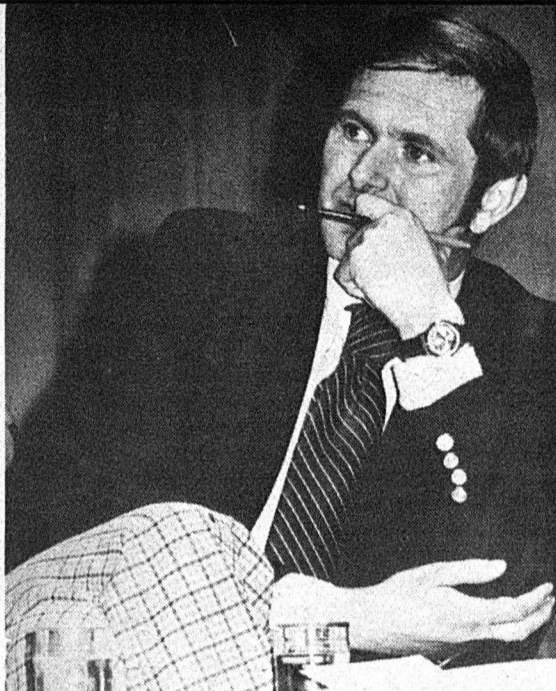
Above: NDP's Notley

Number One in Mexico. Number One in Canada.