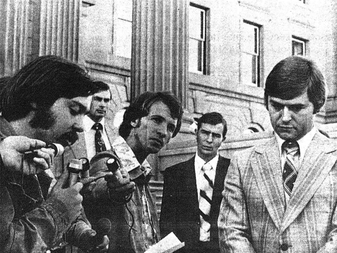
Education minister Julian Koziak preparing for talks with protesting students at the Legislative Bldgs.