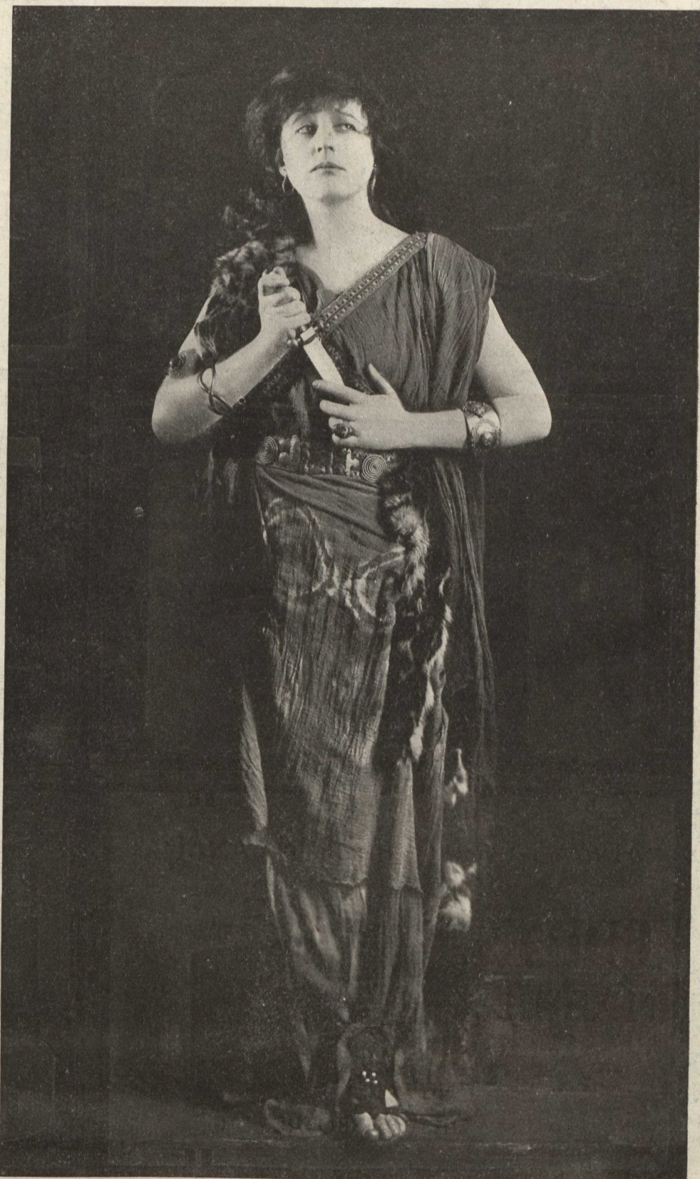
MARGARET ANGLIN, AS MEDEA

Character Sketch of a Famous Canadian Editor