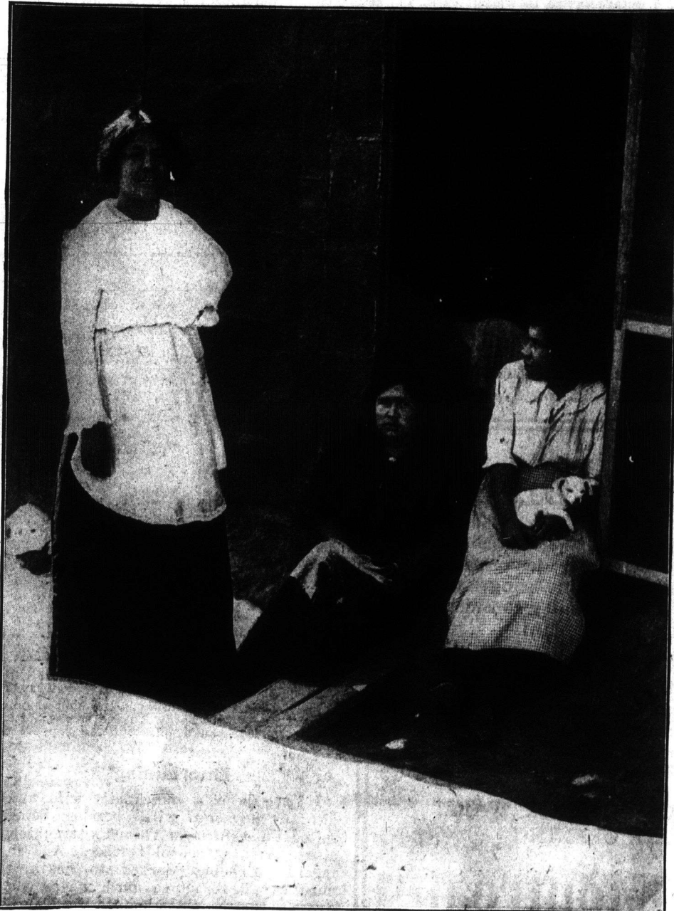
Mexican Belles Not Worried by War's Alarms

When writing advertisers please mention The Western Home Monthly.