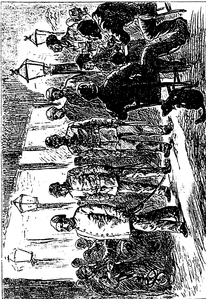
THE LATE COMMANDER OF THE EGYPTIAN GARRISON AT PORT SAID, MAKING HIS NIGHT ROUNDS.