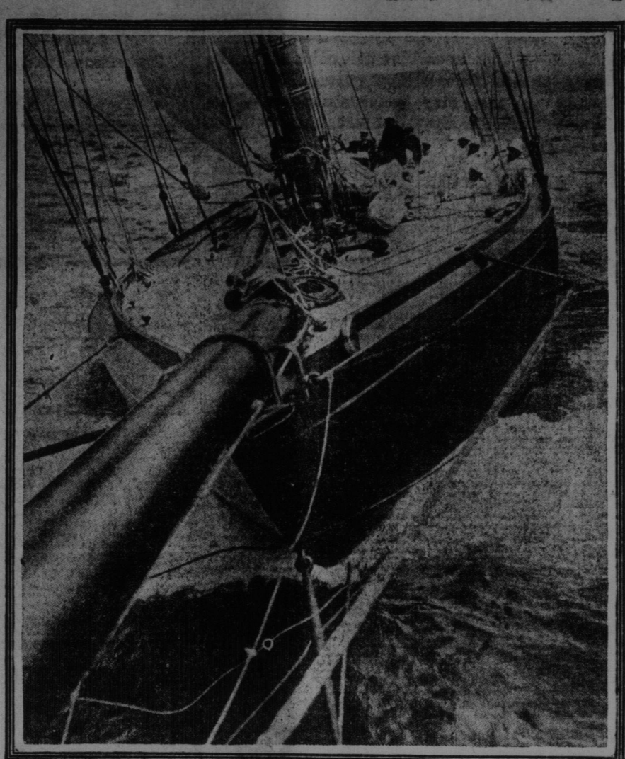
THE SHAMROCK IV IN HER TRIALS AT TORBAY. Shown above is a view of the Shamrock IV. Sir Thomas Lipton's challenger for the America's Cup.