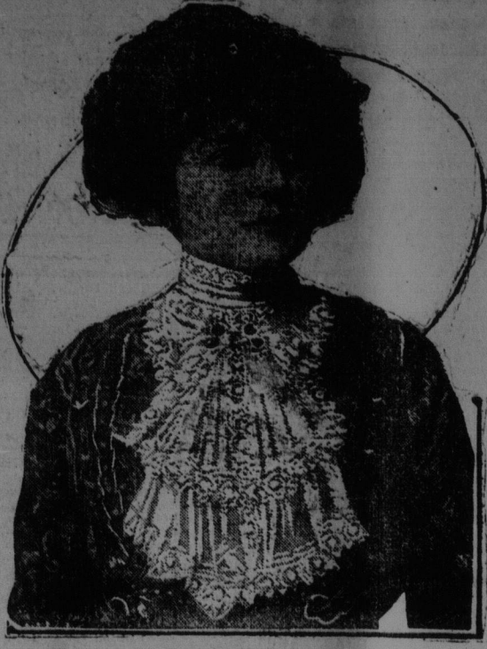
SMART YOKE COLLAR. This is made of the coarse mesh laces and matching insertions, combined with net. The yoke has a deep point in front, and is worn with a full jabot divided in the center by a perpendicular row of insertion.

LADY GODIVA BEHIND CURTAIN NEW PORTRAIT OF WILHELMINA How Heels Came