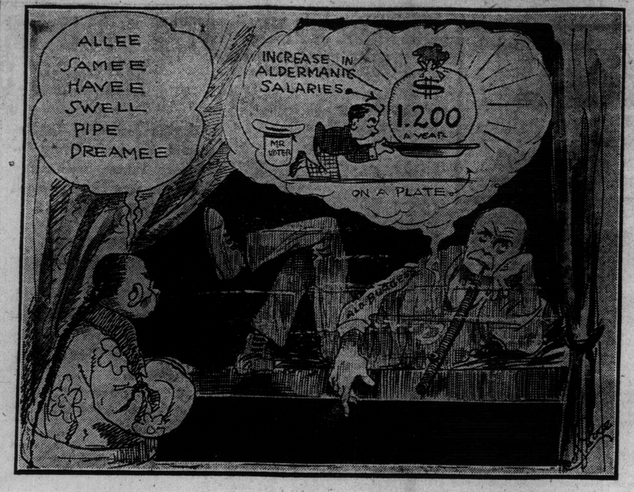
What's the use of dreaming dreams that never can come true?

tion to this it was suggested that if there is any intention on the part of There are three new candidates for the pose, at least there should be an official with power to supervise the it. essessments of any and all municipalities, so that any inequality would The aldermen and school trustees be adjusted. It is certain that under now claming for salaries are not the the present assessment the city of first to attempt to turn a hobby to Toronto would contribute a much financial account. larger amount than its share, as it did during the war period, to any IS URGED TO RATIFY further general levies for provincial purposes. The city of Toronto in its own interest should keep a careful