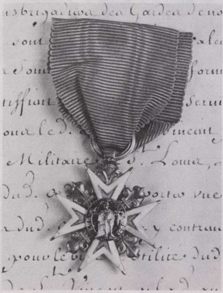
The Cross of Saint Louis instituted by Louis XIV in 1663 was awarded for distinguished service in the armies of France. The first native-born Canadian to receive the cross was Pierre Le Moyne d'Iberville in 1699.

Since 1880 when it started as a small group of trophies and collectibles, the Canadian War Museum has grown to include exhibits ranging from the earliest North American Indian weaponry to modern twentieth-century missiles. While the museum had collected and stored books, records and artifacts since 1880, it was not until 1942 that the first permanent exhibit was opened to the public.