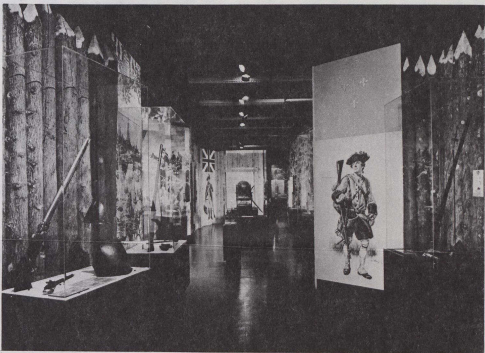
View of first-floor display at Canadian War Museum.

This is accomplished through the use of display cases, pictures, dioramas, audio-visuals, airplanes suspended from ceilings, artwork and reconstructed scenes such as a World War I trench, complete with sandbags, battle sounds and shell flares, through which visitors can walk. All types of weaponry from muskets to huge tanks are also displayed. In addition, the staff car used by Herman Goering during the Second World War is exhibit-