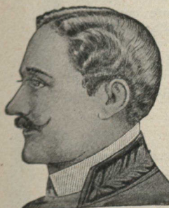
MEN'S TOUPEES AND WIGS

The revival of the Empire style of Hair-Dressing recalls to Grandmamma dear memories of days gone by. The same little story of youthful days and fashion repeats itself again in a younger generation. Let us add to your charms the beautiful