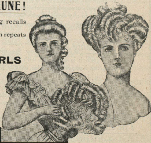
PARISIAN TOUT AU TOUR TRANSFORMATIONS

and Grandma's story will have the true echo. Our Parisian Tout au Tour Transformation on Featherweight Hair Construction are the delight of many a wearer. The largest and best assorted stock of Pompadour Fronts, Waves, and Bangs.