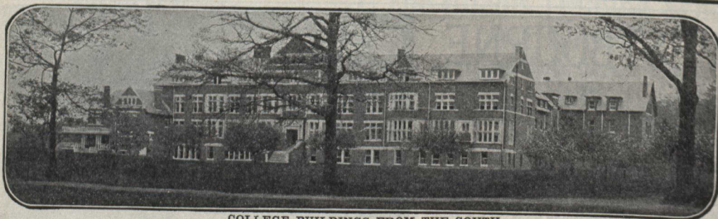
COLLEGE BUILDINGS FROM THE SOUTH