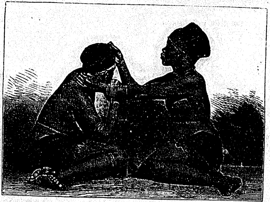
ZULU WOMEN AT THEIR TOILET.