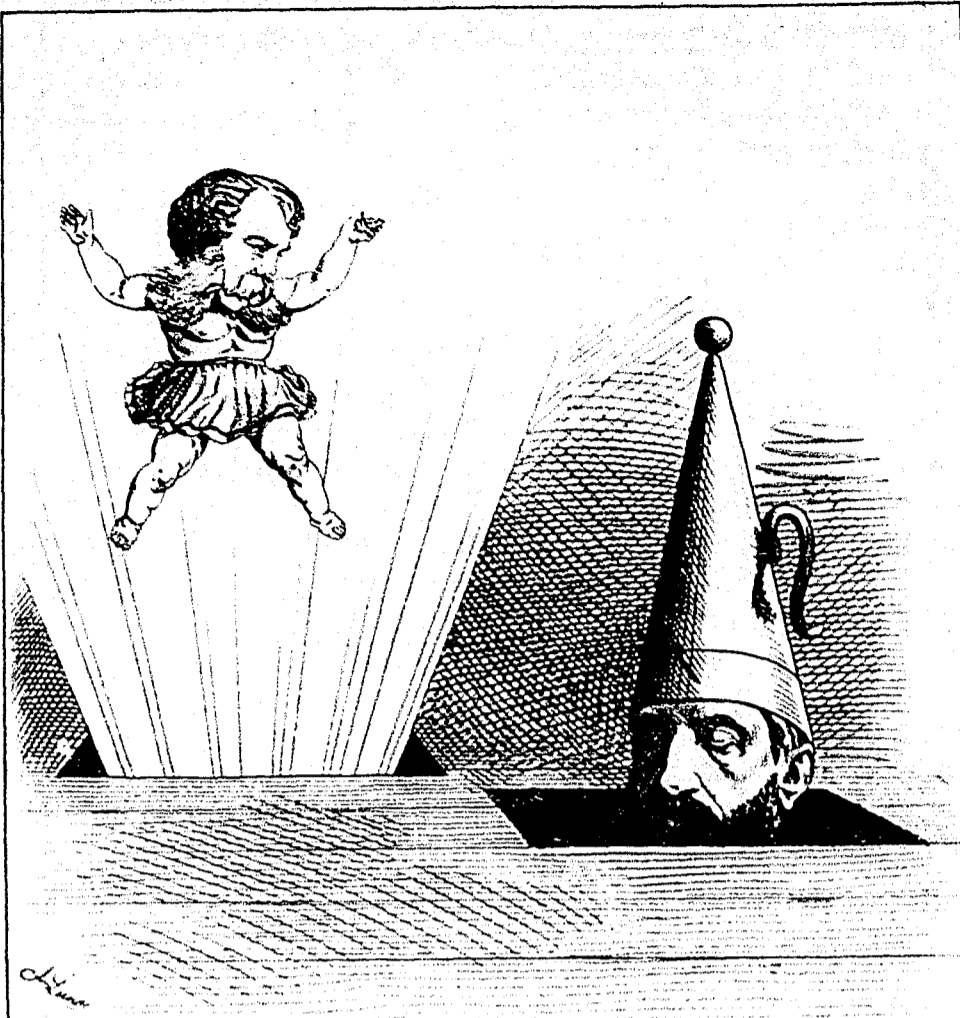
THE UPS AND DOWNS OF LIFE.