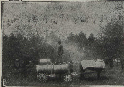
No. 28 in the Orchard

For hand power spraying there is nothing on the market that can touch our Auto-Spray No. 1 with the Auto-Pop Nozzle. In the corner we show a man spraying potatoes with it. It has force enough to turn the leaves and saturate the vines all over. We also make a more powerful hand pump that may be fitted to a barrel or tank for larger operations. Our traction power sprayers range in capacity from 65 to 250 gallons of solution, and every outfit is fitted with an air-chamber sufficiently large to maintain at all times more pressure than is needed. Our No. 28, shown here, is designed especially for the largest orchard operations. You ought to know what we have to offer at least before you buy a sprayer of any kind. Write to-day for our complete catalog and Prof. Slingerland's spraying calendar, free. A request on a postal will bring it. You will find it the finest, most complete book of its kind ever issued.