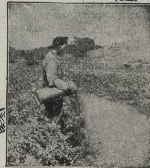
Auto-Spray No. 1 at Work Just the thing for the man with 5 acres or less.

THE E. C. BROWN COMPANY 57 Jay Street, Rochester, N.Y.