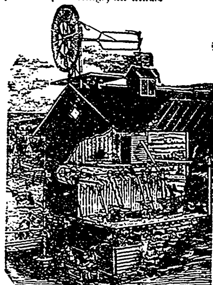
Geared Wind Mills, for Driving Machinery, Pump- ing Water, etc. From 1 to 40 horse power.