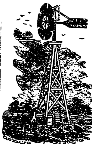
Halliday's Standard Wind Mill, 17 Sizes

State what you want and send for Illustrated Catalogue.