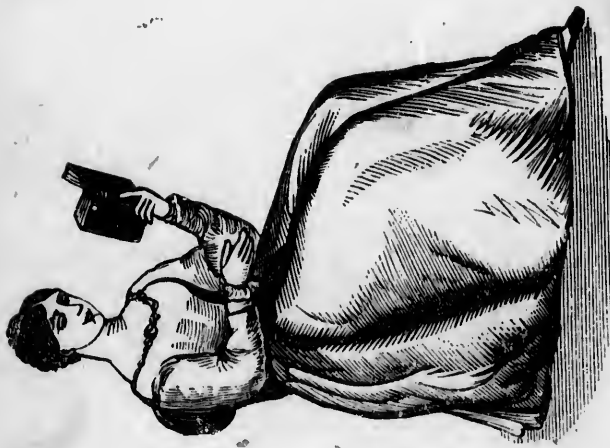
Erect and Proper Position