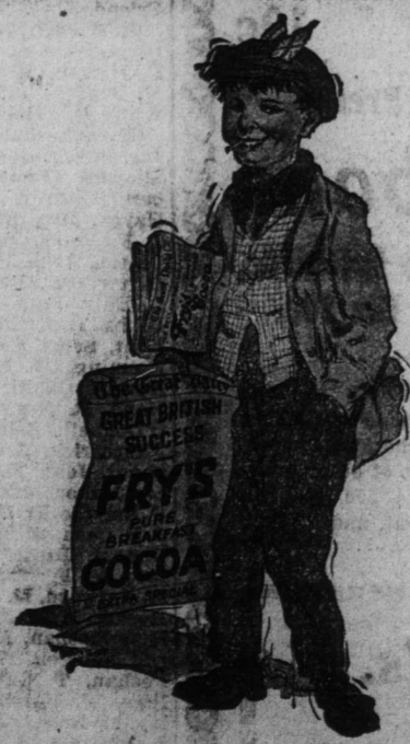
"Always Merry and Bright"