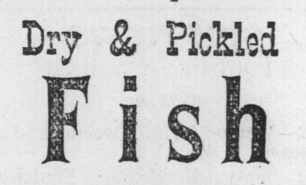
WEST INDIA PRODUCE

DIRECTIONS ODS C 1-The bottled Beer ought immediately after landing be unpacked from the