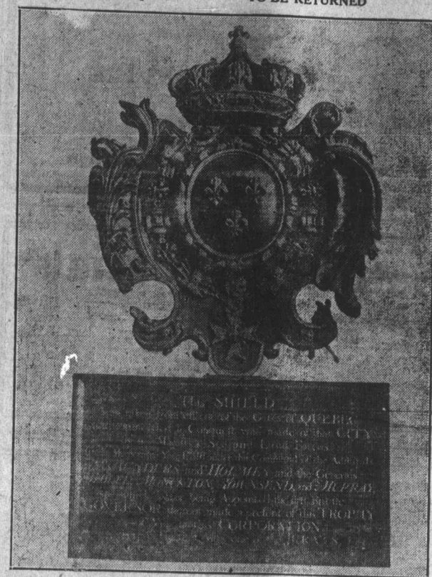
This shield was taken off one of the gates of Old Quebec at the time the city was conquered by Generals Wolfe, Monckton, Townsend and Murray, in the memorable year 1759, and taken to England. Now it is to be returned to Quebec, etc.