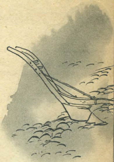
Quebec, three centuries old.

The desire of the "Loyalists" for representative government, shared by later American colonists who came in search of free land, was reflected in the Constitutional Act of 1791 which established popular assemblies. Canada was divided at the Ottawa River into two provinces, Upper and Lower Canada (roughly the present Ontario and Quebec), each with its elected legislature. Although the provincial Governors, with their appointed Executive Councils, still retained control, the first step toward democratic administration had been taken.