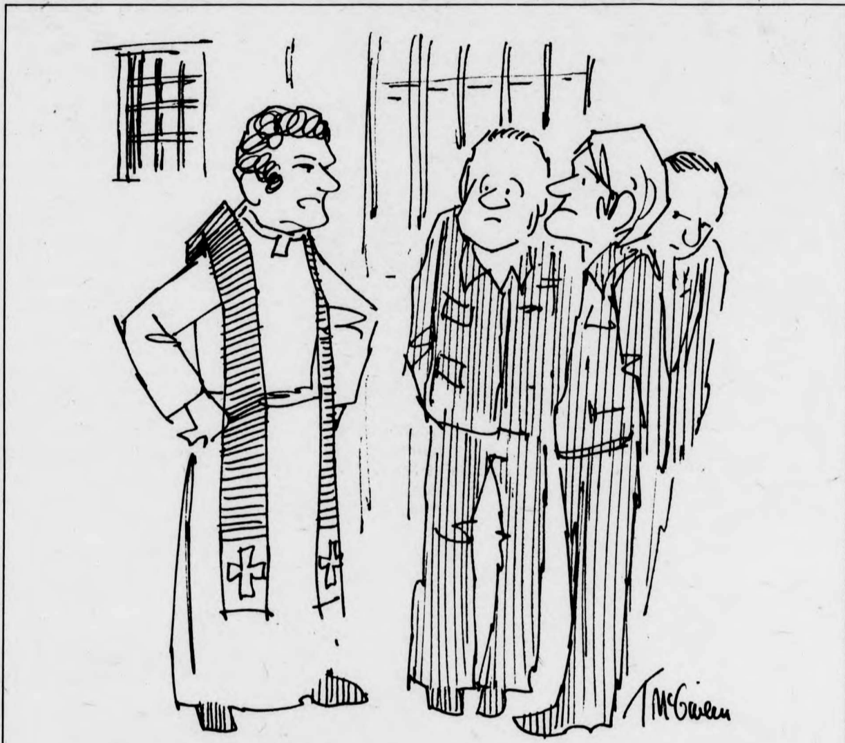
I said, "Take up the collection, not TAKE it!"

The audience passed by an overwhelming majority a resolution calling upon the Canadian government to recognize the People's Republic of Angola.