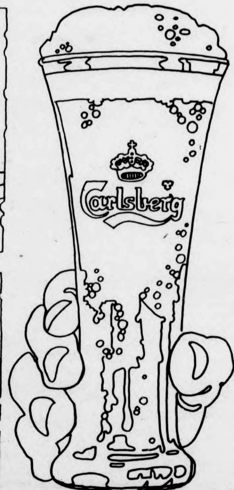
THE GLORIOUS BEER OF COPENHAGEN