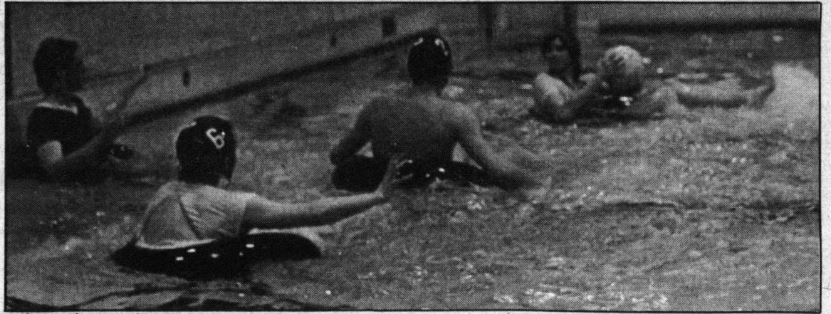
Intramural waterpolo action wrapped up last Tuesday

Game time Friday is at 6:30 instead of the usual 8:45.