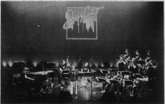
Jazz City '82: a week of super talent