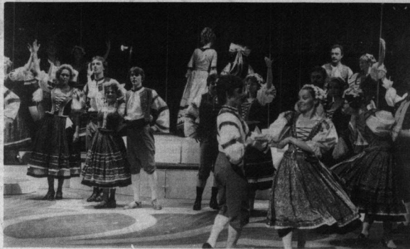
The Merry Widow featured The Alberta Ballet Co.