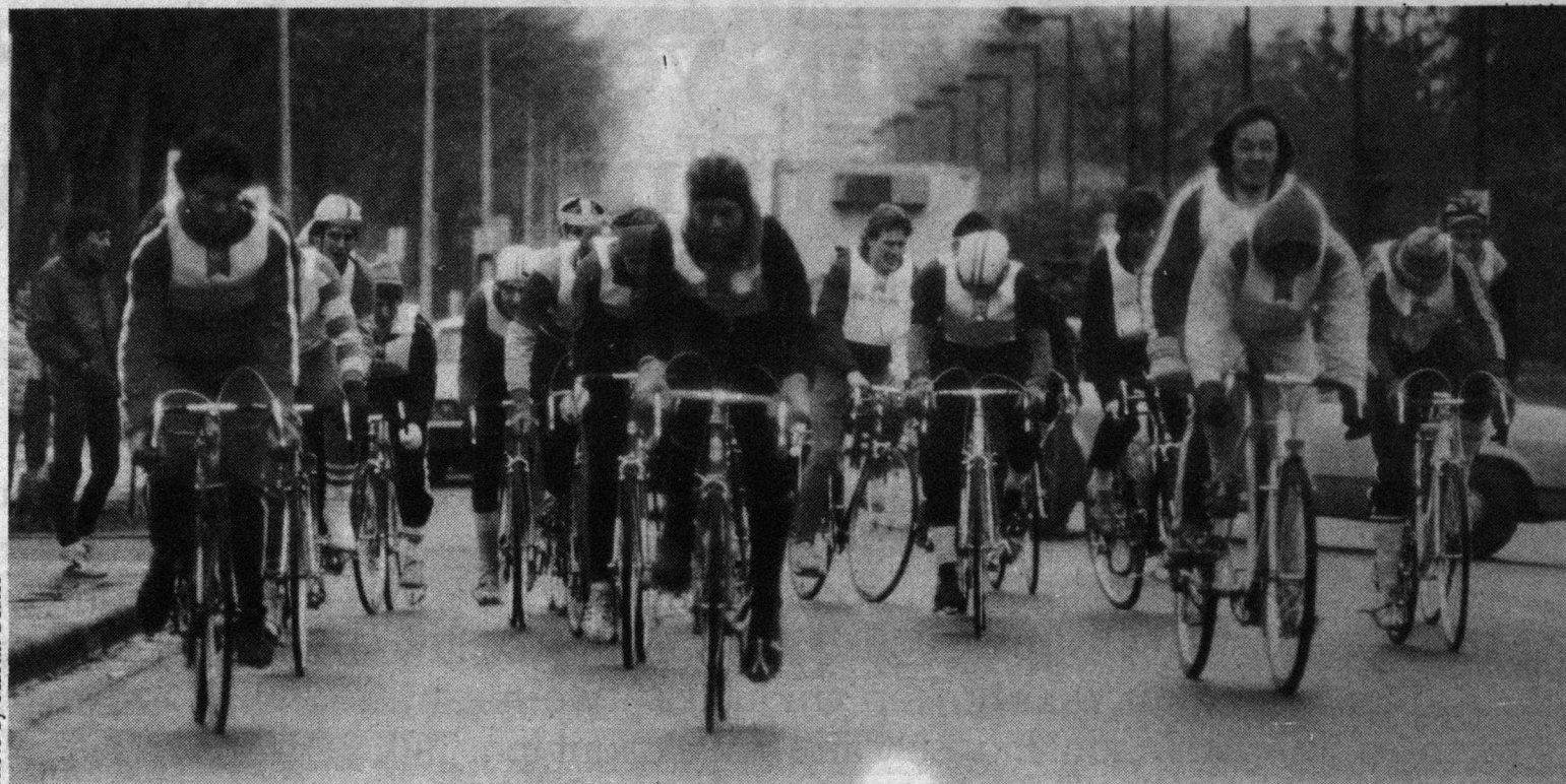
Somewhere in here are 23 bikers. It was only this crowded at the start of a former Gateway sports editor was first across the finish line.

The men's waterpolo tourney gets underway next week