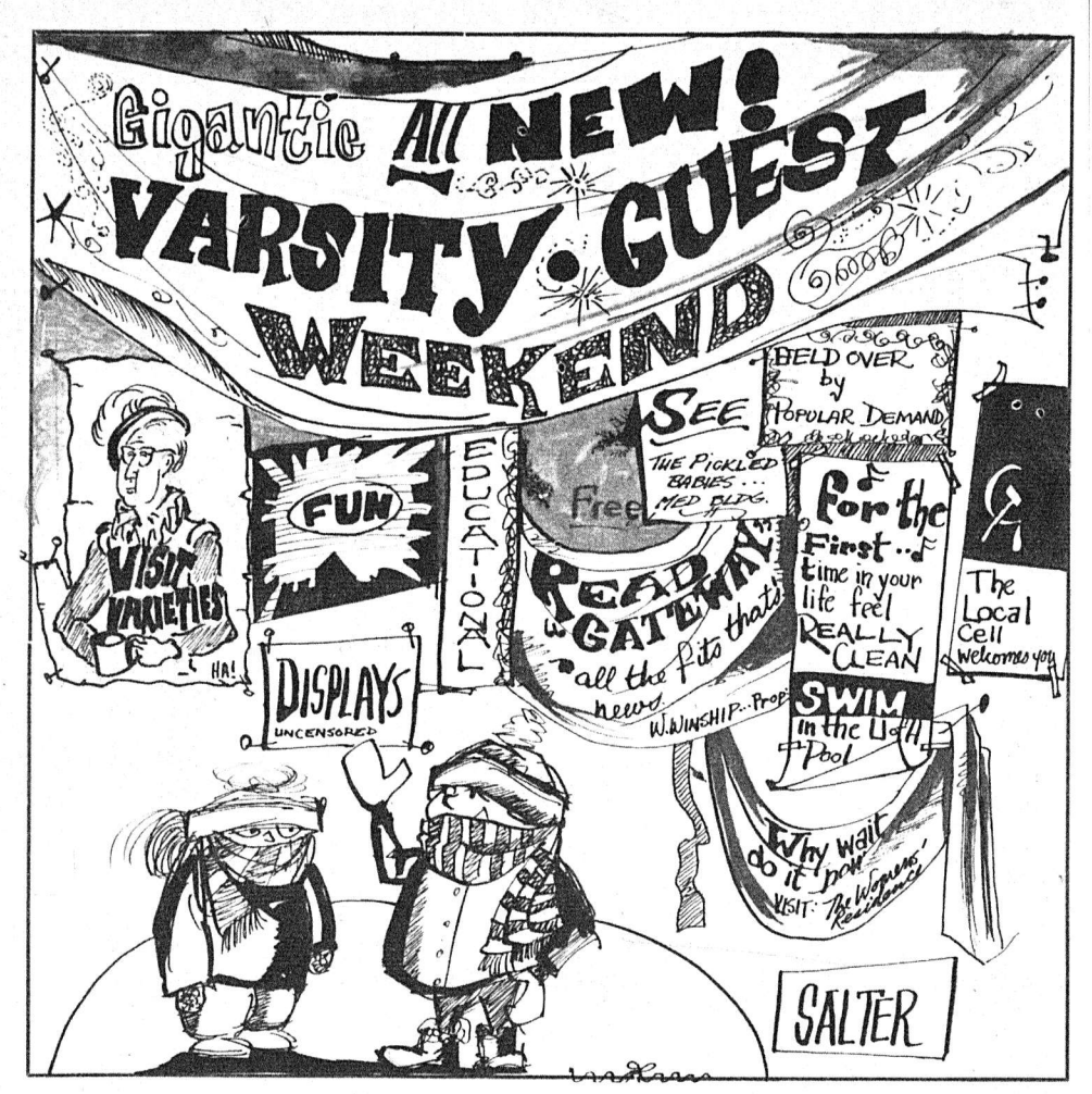
"IT'S LIKE EXPO '67, ... ONLY BIGGER"

Due to the efforts and sacrifices of many, both within and without the immediate field, an opportunity for an education second to none in the world is yours. What does it mean to you?