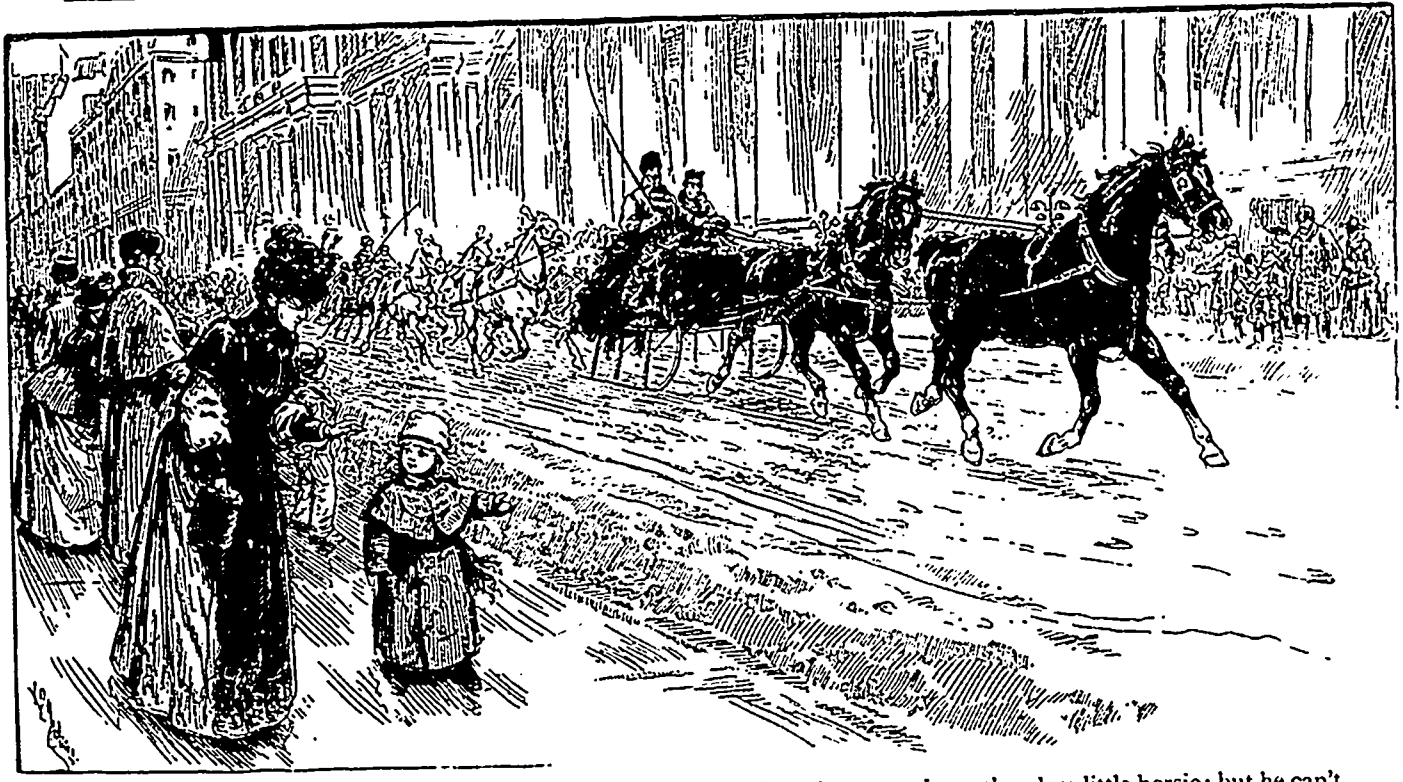
Young Canadian:—Mother, darling, see that one dear little horsie trying to catch another dear little horsie; but he can't.