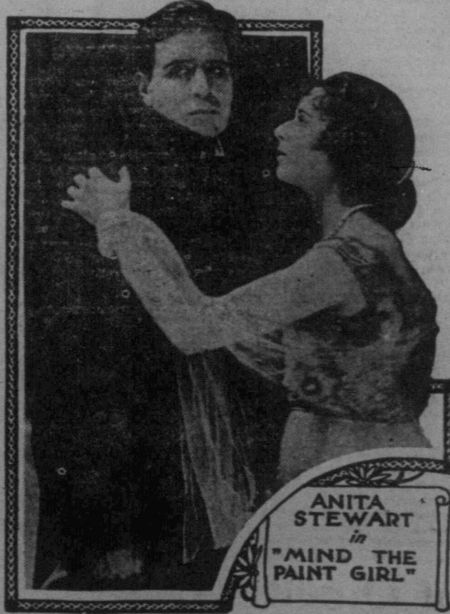
ANITA STEWART in "MIND THE PAINT GIRL"