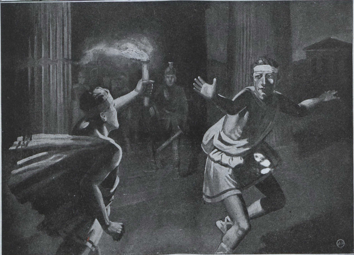
The Torch Relay An Ancient method of Grecian communication